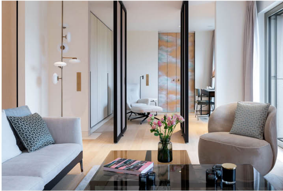
The living room is ingeniously connected to the study via a set of custom-designed pivot doors