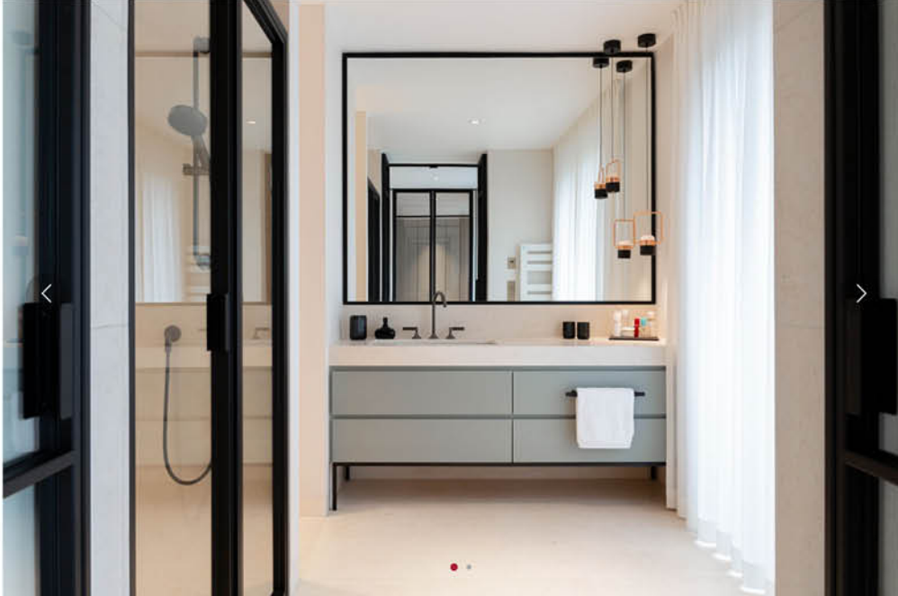
The bathroom exudes an idyllic sense of serenity