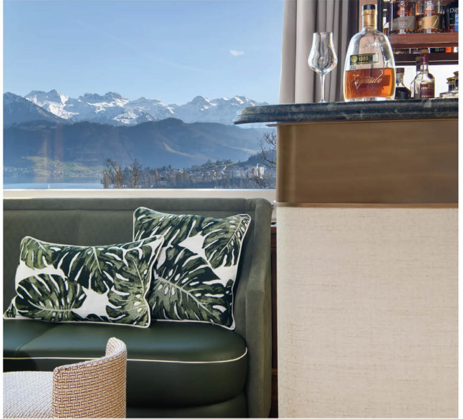
In contrast to the light-filled Scala, the Hemingway Rum & Cigar Lounge embraces darker, moodier tones, evoking an intimate and masculine ambiance. Dark green leather benches, camel-brown hues and bronze accents envelop the space, while custom Maxalto lounge chairs offer plush comfort.