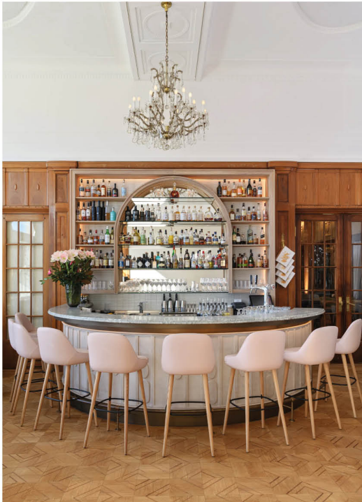
Named after legendary jazz trumpeter Louis Armstrong, the Louis Bar has undergone a remarkable transformation. The space radiates warmth and vibrancy with a stunning curved bar paired with polished wood and an elegant chandelier, making it an inviting spot to savor whiskey or cocktails.